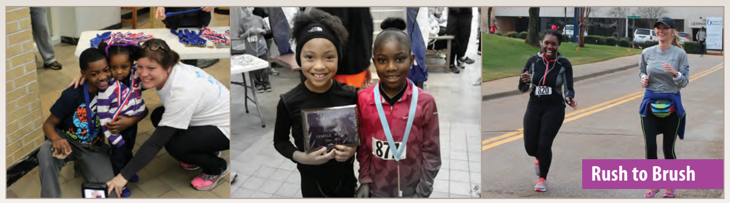
School of Dentistry faculty, staff and students take part in the 12th annual Rush to Brush Feb. 8 on the Medical Center campus. Proceeds from the 5K walk/run and one-mile fun run benefit the Children's Dentistry Clinic at Batson Children's Hospital, the only dental specialty program in the state dedicated to the oral care of children with special health-care needs.